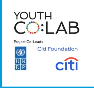
AI4Gov 'Youth Co:Lab,' a UNDP and Citi Foundation initiative