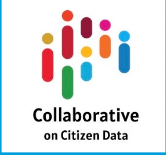
Collaborative on Citizen Data UN Statistics Division