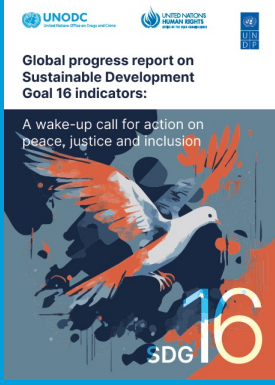
SDG 16 Survey Initiative & Global SDG 16 Progress Report UNDP, UNODC, and OHCHR